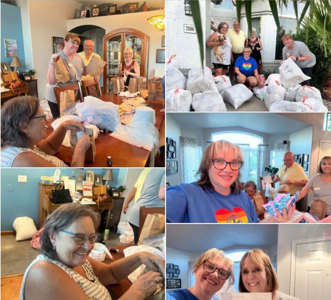
Go Gilbert Rotary Club! Supporting the mission of packing products for Women4Women to distribute.