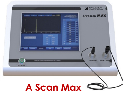
A Scan Max