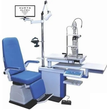
Refraction Chair unit