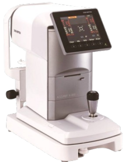
Non Contact tonometer