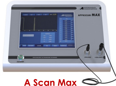
A Scan Max