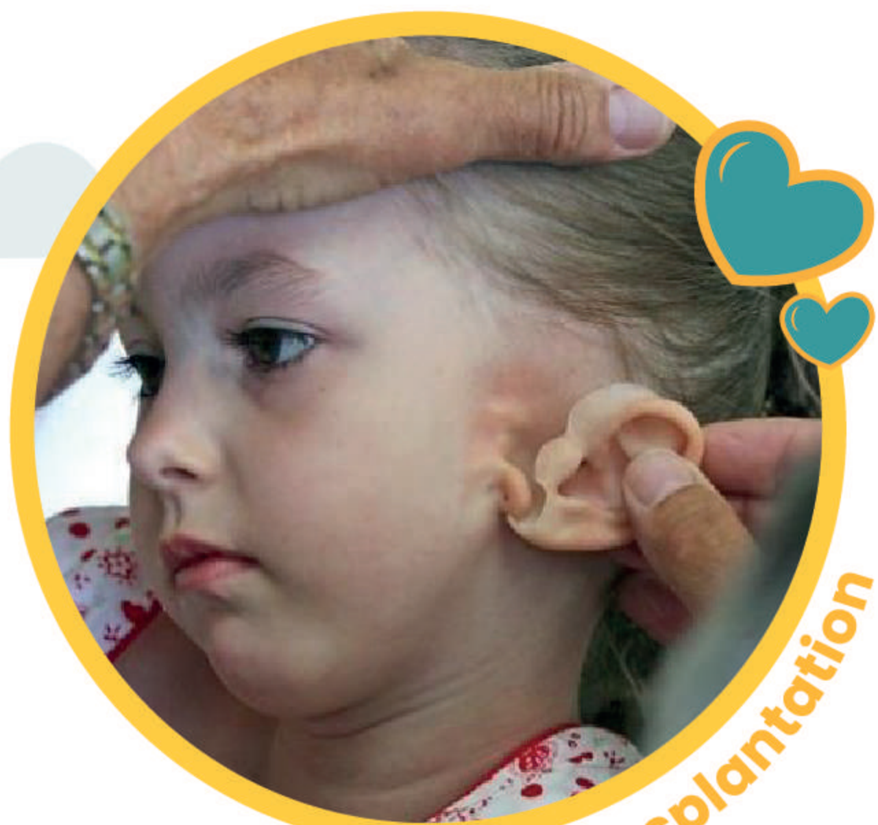
Ear pinna transplantation

Secretary of Health, University Hospital of Valle, University of Santiago de Cali and Colombian School of Rehabilitation.