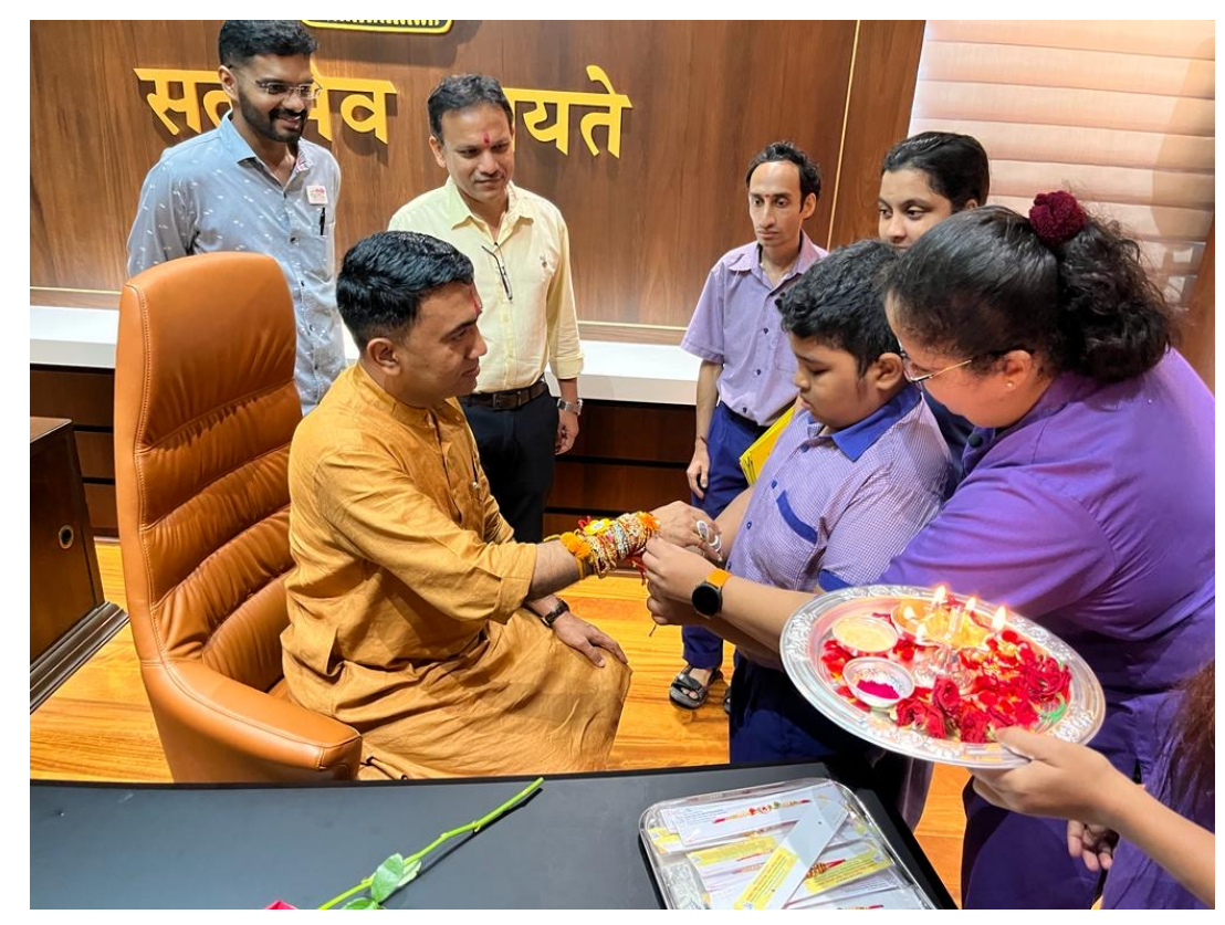
Raksha Bhandhan Celebration with the Chief Minister of Goa